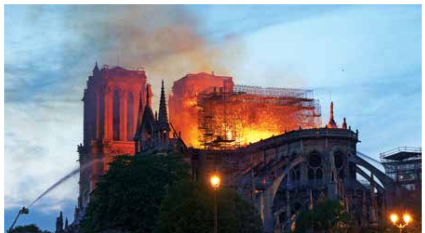
Smoke and flames surrounded the spire. Then the spire fell and the fire began to rage. As darkness came, the fire started to come under control.