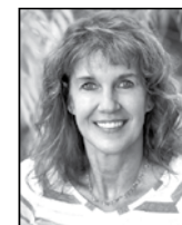
Certified Professional Photo Organizer

Photo & Digital Organization | Scanning & Digitizing Services Slide & Negative Scanning | Photo Memory Books Video Montages | In-home Consulting