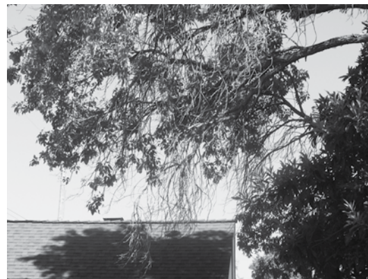
To prevent dead branches from falling, they must be removed as soon as possible.

There are signs one can look for in a tree that is about to blow over. The tree was vertical and now has a significant lean