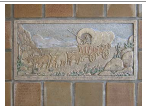
Covered wagon scene

Art tile fireplace, likely Muresque Tiles of Oakland