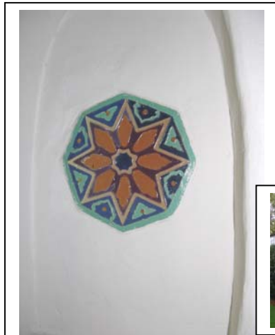
Entry niche tile

Tiles likely produced by California Faience Tile of Berkeley (the firm also produced tiles for Hearst Castle in San Simeon)