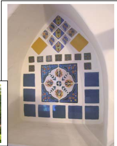
Dining room niche