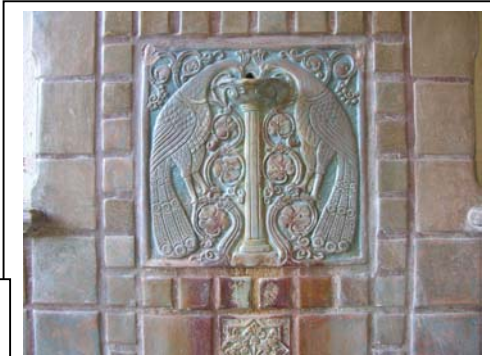
Peacocks on fountain